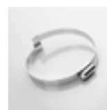
Master-Grip Hose Clamp, screwable