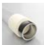
Combiflex PU Cast-On Connectors, Food