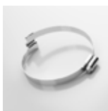
Car-Grip Hose Clamp, screwable

Subject to technical changes and colour deviations.