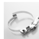
Car-Grip Quick-Fix Clamp