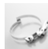
Master-Grip Quick-Fix Clamp