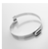
Master-Grip Hose Clamp, screwable