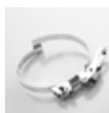
Master-Grip Quick-Fix Clamp