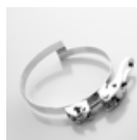
Clip-Grip quick action clamp