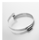
Clip-Grip Hose clamp, screwable