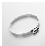
Hose Clamp with Worm-Gear Drive

Subject to technical changes and colour deviations.