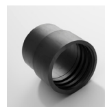
Cuff for Master-PVC Flex