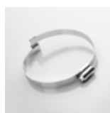
Master-Grip Hose Clamp, screwable