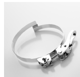
Clip-Grip quick action clamp