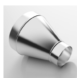
Hose Reducer, symmetrical

Subject to technical changes and colour deviations.