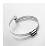
Clip-Grip Hose clamp, screwable