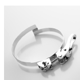
Clip-Grip quick action clamp