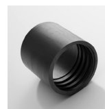
PU Cuff, pre-fitted