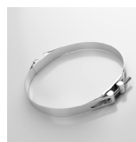
Hose Clamp with Bolts