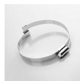
Clip-Grip Hose Clamp, screwable

Subject to technical changes and colour deviations.