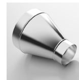
Hose Reducer, symmetrical